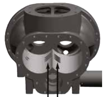
BYPASS PORTS IN STATOR Rotors removed to show Bypass Ports